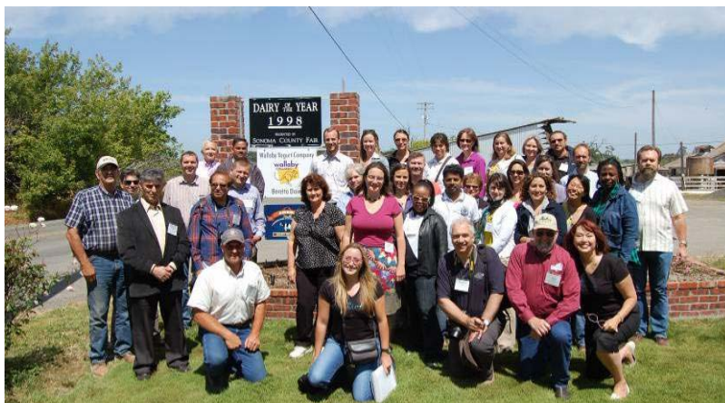
Conference Field Trip